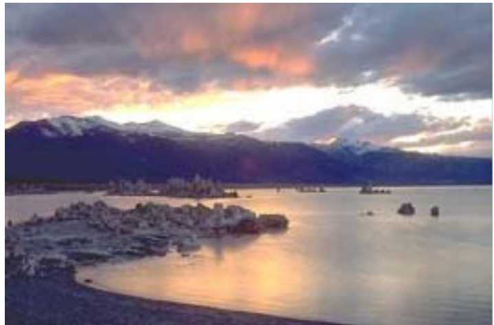
Today, Mono Lake is appreciated for its unique ecosystem and beauty.

The annual gull counts continue – I participated in one last summer. Mono Lake is no longer an unknown place – last year, over 250,000 people visited – many from Los Angeles (Education). And through conservation measures, the people of Los Angeles still have water to drink.