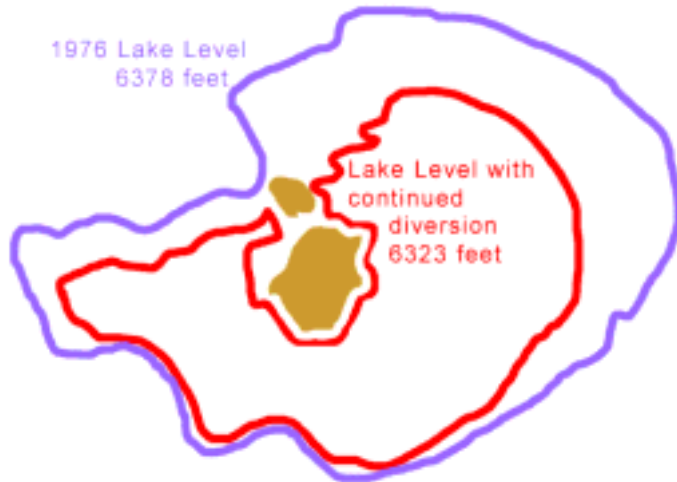
(graphic modified by author from Ecological Study )

The study established that at 1976 diversion levels, the lake would eventually drop to 6,323 feet before stabilizing. At such low levels, the lake would lose 45% of its 1976 volume. Alkali